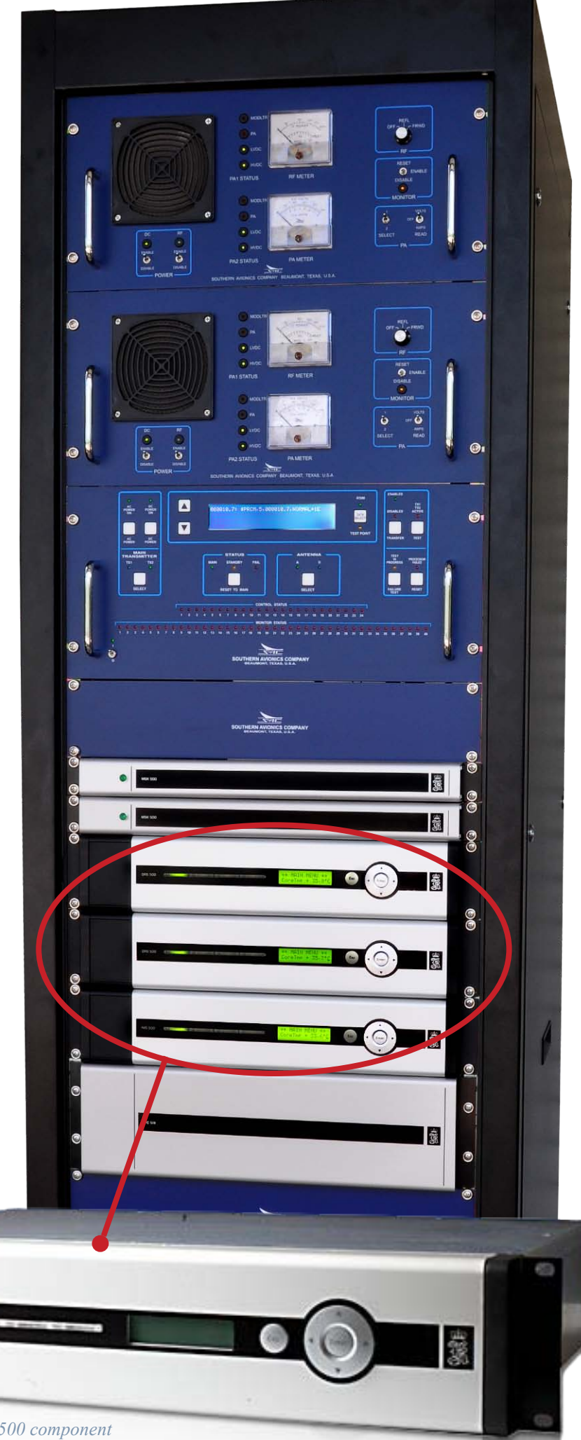
Kongsberg DRS 500 component