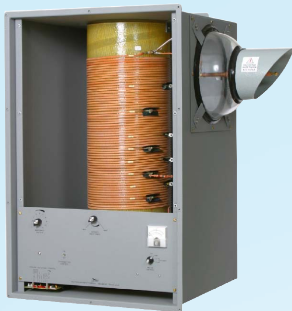
PC1KILO Antenna Coupler